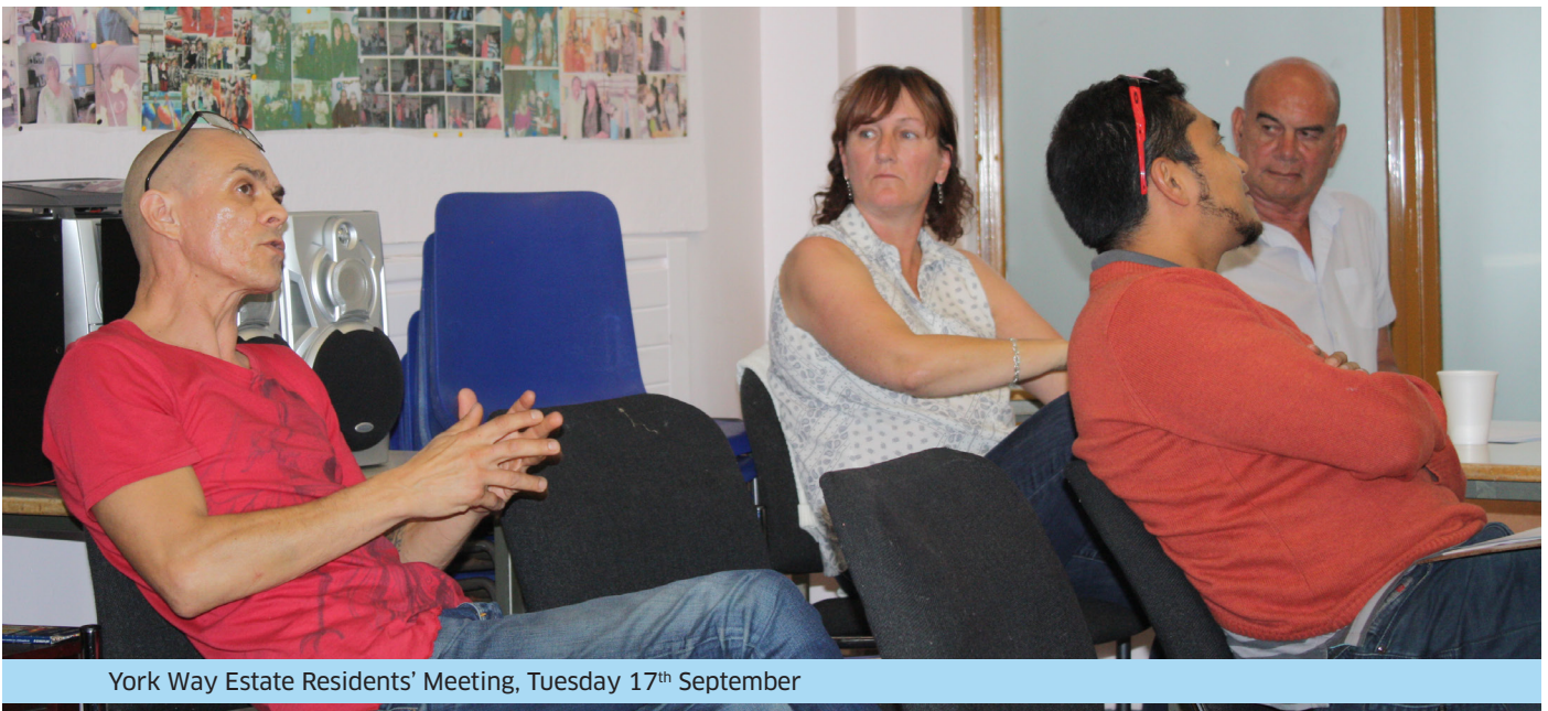
York Way Estate Residents' Meeting, Tuesday 17 th September