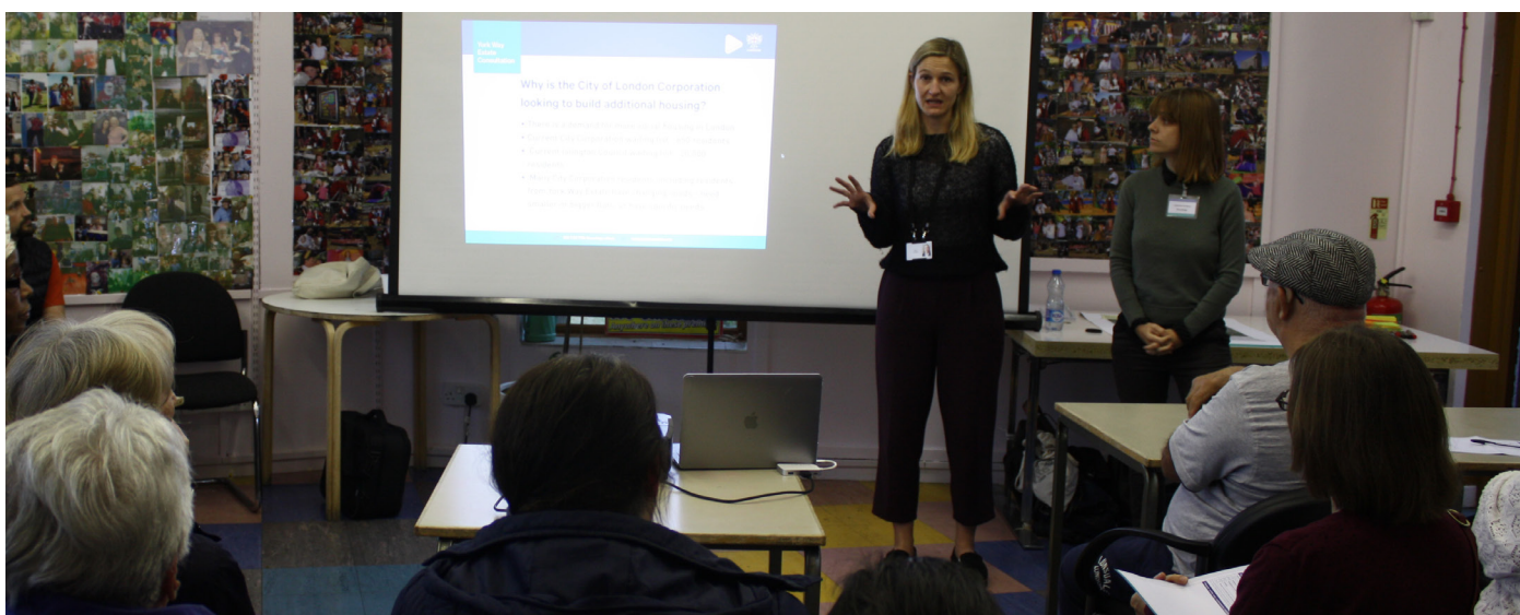
York Way Estate Residents' Meeting, Monday 16 th September